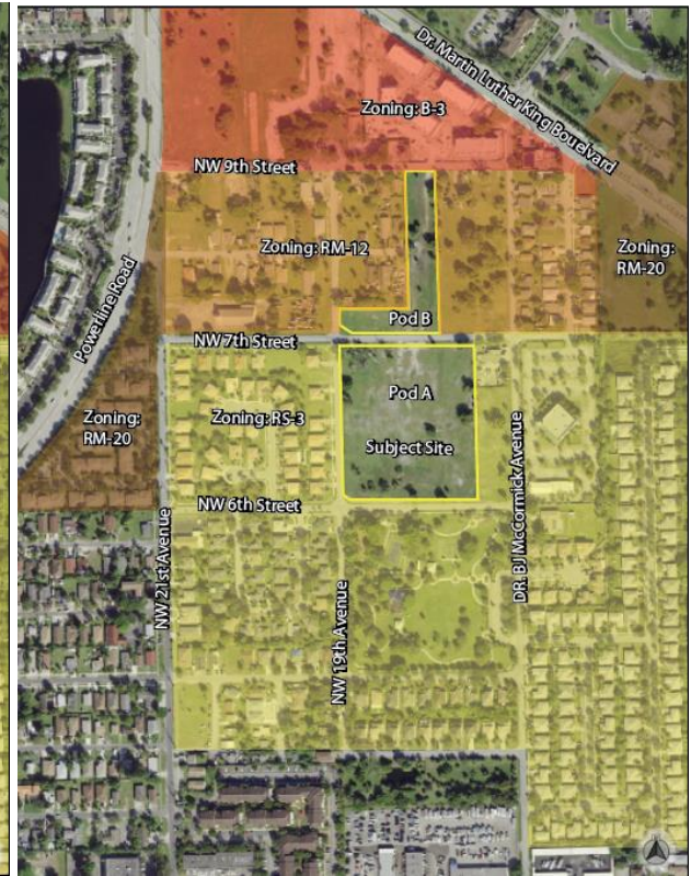
Subject Site – Zoning Map