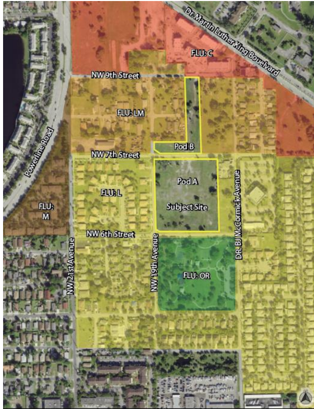
Subject Site – FLU Map